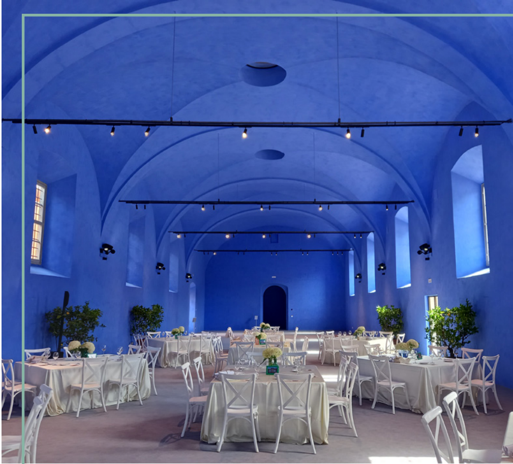
Lemon Houses The Stables